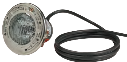
AquaLight Halogen Lights

The AquaLight light uses halogen quartz bulbs and designed for installation in small plastic or stainless steel Pentair niches. The light shell is high-quality stainless steel and the lens is Prismatic tempered glass.