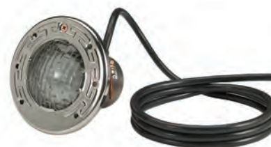
SpaBrite Incandescent Lights

⚠ WARNING: Cancer and Reproductive Harm. ⚠ AVERTISSEMENT: Peut Causer le Cancer et des Dommages au Système Reproducteur. ⚠ ADVERTENCIA: Cáncer y Daño Reproductivo. www.p65warnings.ca.gov P/N 201714